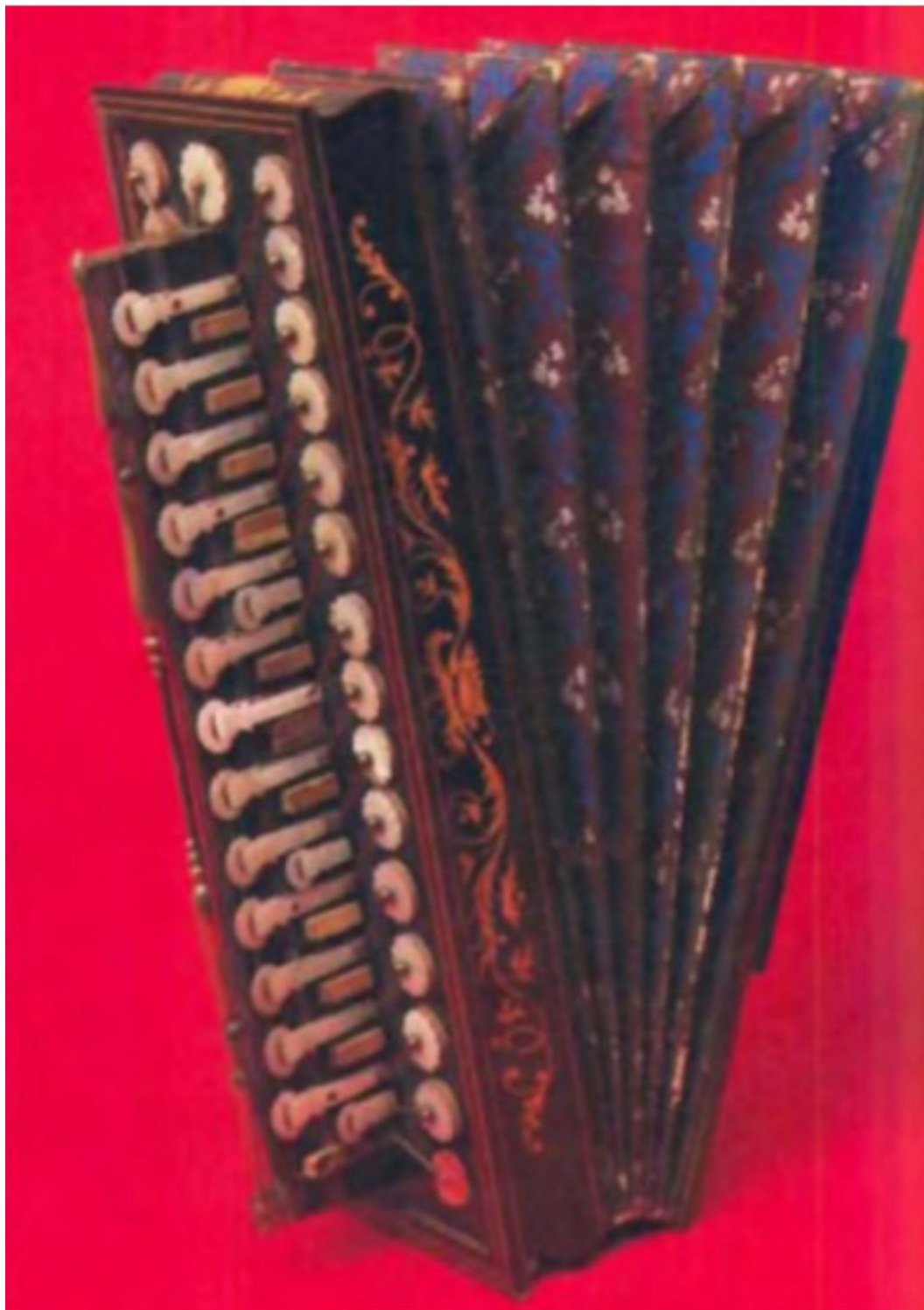
Acordeón de Forneaux (Francia, 1835) 13

- Accordion builders: Vienna (Demian in 1829 14 , Thie in 1833 15 , Mueller in 1834 16 and Bichler & Klein in 1834 17 ), Russia (Sizov in Tula in 1830) 18 , Paris (Isoard in 1831 19 , Reisner 1832 20 and Forneaux in 1835 21 ), Germany (Reisel at Klingenthal in 1833 22 and Sparthe at Gera in 1834 23 ), USA. (Carhart in New York in 1835) 24 and Switzerland (Drollinger in 1836 25 ).