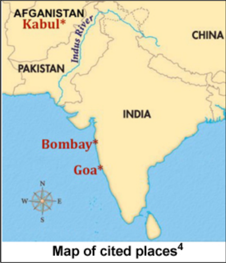
Map of cited places 4