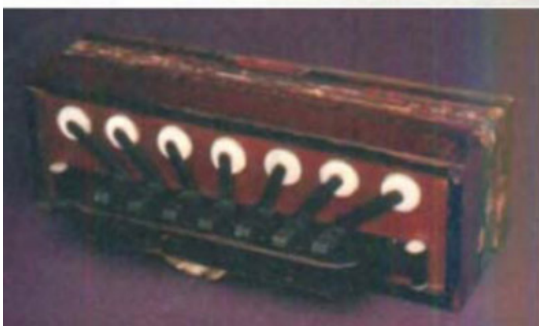
Acordeones de Demian (1828 - 1829)